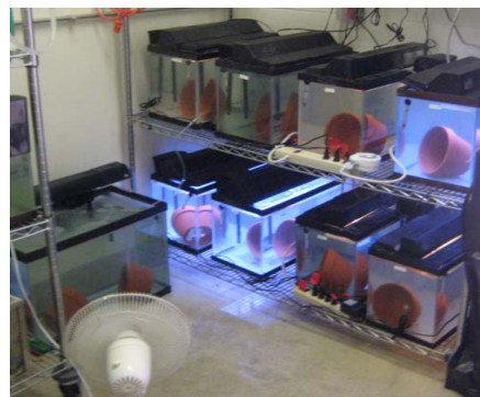
Figure 1. Tank set-up with 75.7L tank on the left.

Data were analyzed using a chi-square test with a 0.05 level of significance. It was expected that if there were no EE2 effects, then all fish should appear as adults.