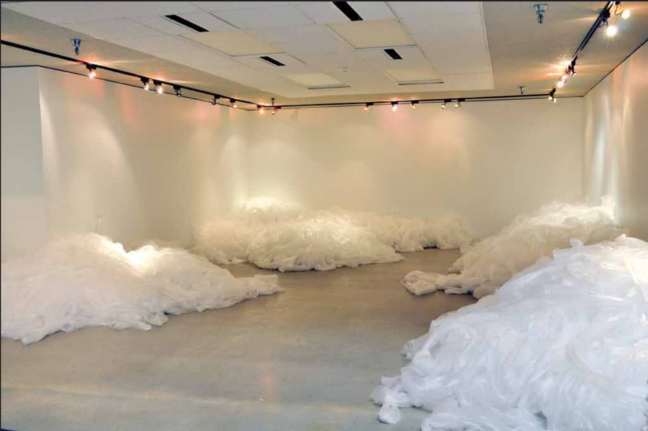
Erica Duffy Voss